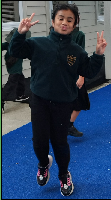
I LIKE TO MOVE IT MOVE IT

Some of the teachers and teacher aids join in and we all have so much fun! We have lots of very talented dancers at our school and we all love letting loose.