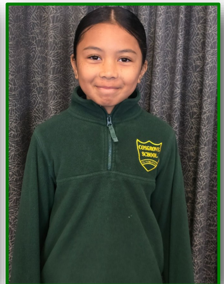
Lyrical Hapi - Ruru